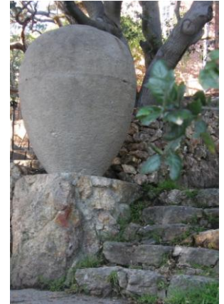
Right: last original Thousand Oaks concrete urn.

Historic LeRoy Steps, a well travelled shortcut to campus, has a new partner group: the LeRoy Stewardship Project worked with UC's Police Department to obtain a $7,160 Chancellor's Community Partnership grant to install pedestrian lighting, improving safety on this busy pedestrian route.