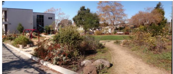
Neighborhood-created oases: Presentation Park, left, and Schoolhouse Creek Common, right.

At Schoolhouse Creek Common at Curtis and Virginia, neighbors planned and carried out the metamorphosis of bare hardscape to colorful drought-tolerant flowers, children's play area, picnic table and chess board, shade trees, mini-lawn, and more. Monthly work parties continue, but the new park is truly a beautiful Common, serving neighbors and students at the adjacent Berkeley Adult School.