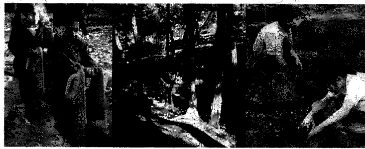
Improving Berkeley's parks, community gardens, paths, and open space.