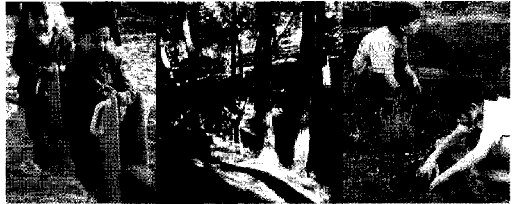
Improving Berkeley's parks, community gardens, paths, and open space.