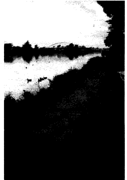
Clockwise from top left: The historic John Hinkel Clubhouse, neglected and shuttered. The seriously eroded pathway along the east shore of Aquatic Park. The roof is leaking at Frances Albrier Recreation Center in San Pablo Park.

source of community volunteerism and small improvements in the parks, but they usually do not and can no longer cover the essentials because of the amount of money and skill needed.