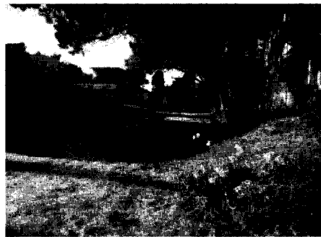
An undeveloped portion of the Santa Fe Right of Way that could form a greenway trail from Strawberry Creek Park to the Ohlone Greenway.

A well-designed and adequately funded right-of-way would create a south to north-west Berkeley pedestrian trail that